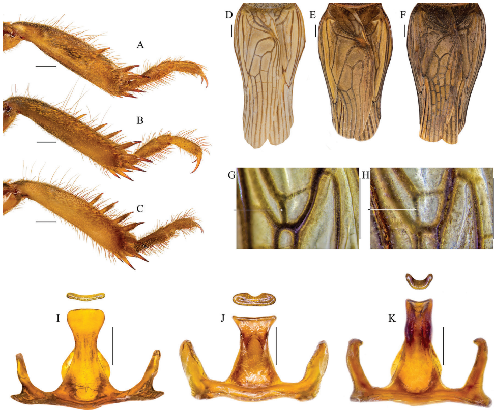
Figure 1. Inner part of hind tibia: A Gryllotalpa unispina B G. stepposa C G. gryllotalpa . Dorsal view of male tegmina: D Gryllotalpa unispina E G. stepposa F G. gryllotalpa . Distal part of the median vein (♂): G Gryllotalpa stepposa H G. gryllotalpa . Epiphallus: I Gryllotalpa unispina J G. stepposa K G. gryllotalpa . Locations: Gryllotalpa unispina – Letea; G. stepposa – Șura Mare; G. gryllotalpa – Pașcani (Romania). Scale bars 1 mm.

Sea coast, surroundings of the Caspian Sea, central and south-western Asia (Zhan-tiev 1991; Gorochov 1993), G. kimbasi prefers inland humid habitats and seemingly avoids saltings.